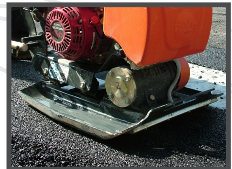
IDEAL FOR ASPHALT / MACADAM SURFACES