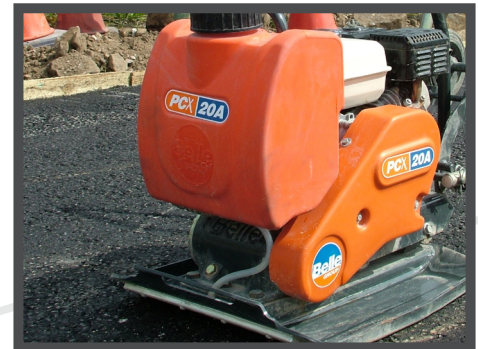
LARGE CAPACITY WATER TANK AND SPRAY BAR